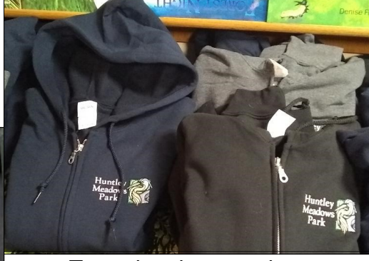
Zip up hoodie sweatshirt.