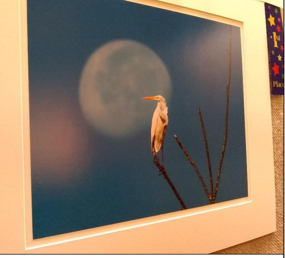
Egret Moon by Paul Lebras, 2018 FOHMP Photo Contest first place winner.

Photo submissions will be $10 per entry with a maximum of three entries. Photos should have been taken at Huntley Meadows Park over the last two years and focus on the landscape, plants, and animals of the Park. Entrants will need to have a Flickr account to submit, which is free to create.