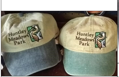
FOHMP logo ball caps.

*This offer is valid only at this in-person event and while supplies last.